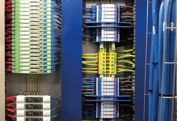
Optimum protection of control and telecontrol systems with a coordinated surge protection concept