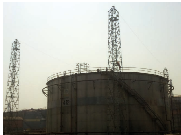
Protection of the storage tanks by means of lightning protection masts and overhead line systems